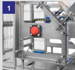
1 Paper trays de-nester with easily format changing with pneumatic control. Easily disassembling system for cleaning and format change