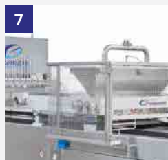
Volumetric doser machine Dosamatic or Dosatronic for jam, creams, fruit souce and chocolate