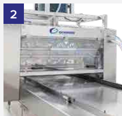
Spraying guns at high-nebulization performance equipped with special nozzles that insure a perfect nebulization using a very low pressure