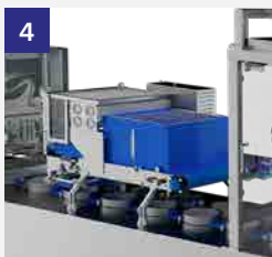
Dosing unit for crumbled with motorized reels to crumble the pastry and to trim the thick-ness