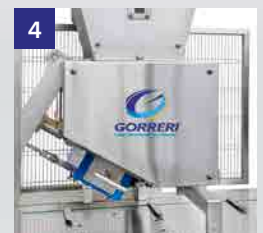
Roller extruder for short pastry dosing