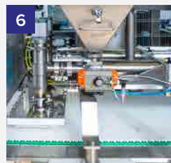
Volumetric doser machine dosamatic or dosatronic for cheesecake cream with no-tools disassembling system to easily wash and clean components