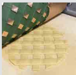
Rotary mold for the production of the short pastry net