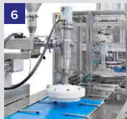
Volumetric or electronic dosing machine for cream and jam