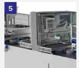
Pressing unit for crumbled with pneumatic pressing device