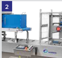
2 Trays conveyor