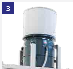
Oil moist aspiration by centrifugal filter lodged in the upper part of the device with integrated oil recovery