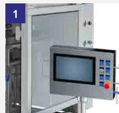
HMI Touch screen panel