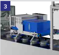
3 Roller extruder for short-pastry