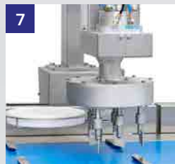
Swirling device for jam, creams, fruit souce and chocolate