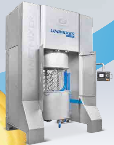
→ PlanetMixer Series Pressurized-vertical mixing system