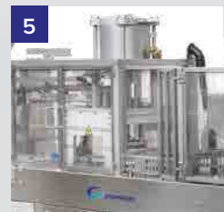
Pneumatic pressing device equippend with stainless steel heated head coated with teflon.