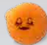
24 • Printed cakes