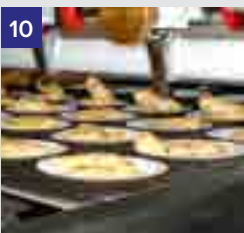
10 Batter dosing unit