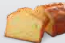
19 • Pound cake