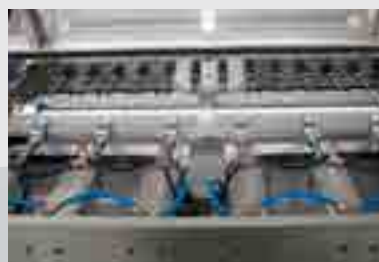
Gorreri Dosatronic electronical depositors Gorreri Dosamatic pneumatic pistons depositors