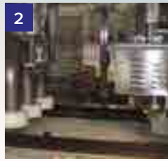
2 Baking pans brushing system and crumbs removal