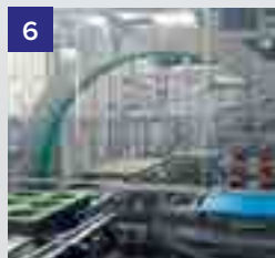
Baking pans overturning unit