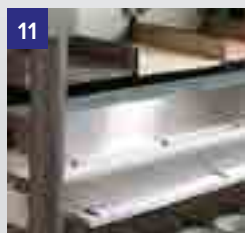
11 Grains distributor