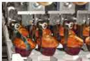
Two-phases paper cup detachment to guarantee a precise separation. Pneumatic movement. For paper cups of every size and shape (even "Tulip")