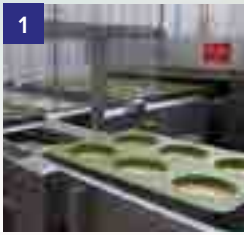
1 90° trays exchange and oven trays infeed