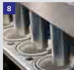
Paper cup denesting unit