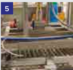
Baking pans de-molding unit with needles