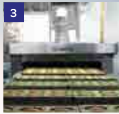
3 Oven trays outfeed