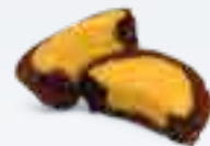
8 • Twin colours cakes