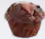
4 • Filled muffin