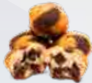
2 • Marmor muffins