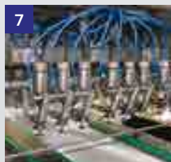
Baking pans greasing unit