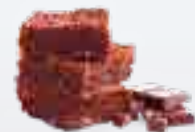
16 • Brownies