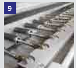
Piston and dosing cylinders details